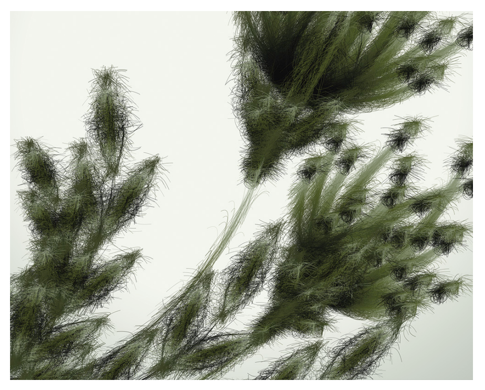
Fig. 3. "Superfolia": 6 panels 70x150cm realized using an agent-based approach (a single blade of grass responds to its neighbors).