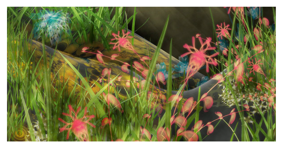
Fig. 1. Prototype of the City In A Bottle game world, with two kinds of flowers thriving.

control the environment in full; only local actions such as planting a seed or catching and domesticating an insect are allowed.